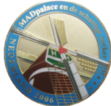
Team Aragorn gold

The organization hopes you enjoyed this tour through The Landscape Park. Questions/remarks can be made in the guestbook or at geocaching.com .